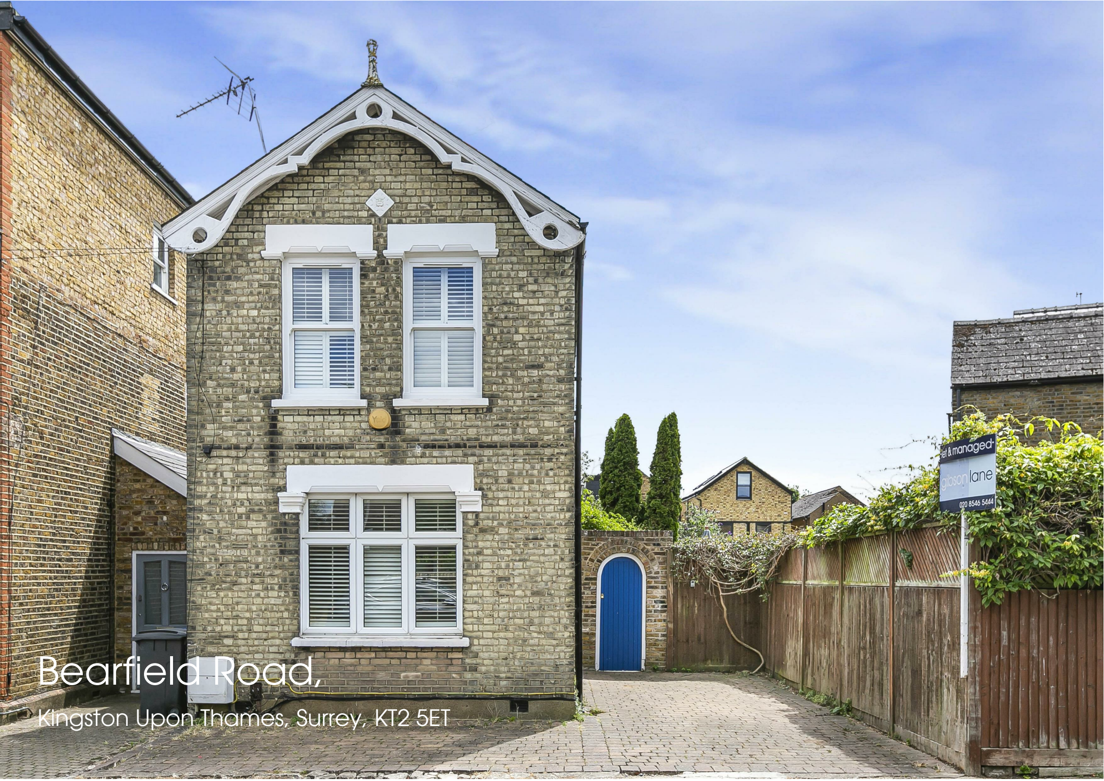
Bearfield Road, Kingston Upon Thames, Surrey, KT2 5ET